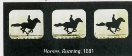
Horses, Running, 1881

Eadweard Muybridge is probably best known for proving through photography that horses fly by lifting all four hooves off the ground when galloping. This exhibition includes a 17-foot panorama of San Francisco and Muybridge's zoopraxiscope invention, one of the earliest examples of projected motion pictures, in action.