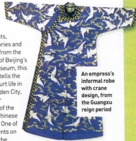
An empress's informal robe with crane design, from the Guangxu reign period

Displaying more than 50 garments, 20 accessories and 15 fabrics from the collection of Beijing's Palace Museum, this exhibition tells the story of court life in the Forbidden City, the former residency of the imperial Chinese dynasties. One of the garments on display is the wedding dress robe worn by Yehe Nara Jingfen for her marriage to the Guangxu emperor in 1889, which boasts an exquisite red dragon and phoenix decoration.