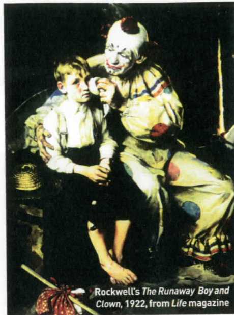
Rockwell's The Runaway Boy and Clown , 1922, from Life magazine