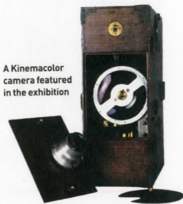
A Kinemacolor camera featured in the exhibition

Early colour photography, chromatopes, kromscops and applied colour films all appear in this exhibition, which aims to tell the story of the quest for colour on film through rarely seen material from regional, national and private film archives and collections. The legacies of Kinemacolor, Kodachrome and Technicolor are also covered in the exhibition, along with Brighton's role in producing pioneers of colour films – from their humble beginnings in the city to royal patronage and international acclaim.