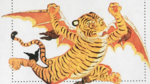
Part of a brocaded silk satin military banner from the Ming dynasty

Until 12 February 2011 ☎ 020 7307 5454 ▶ www.asiahouse.org