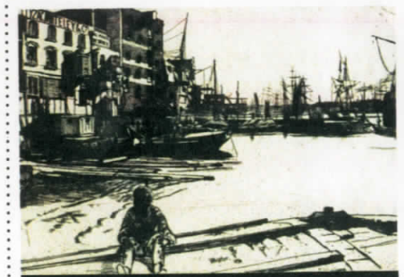
Whistler's Eagle Wharf , 1859, will be on display